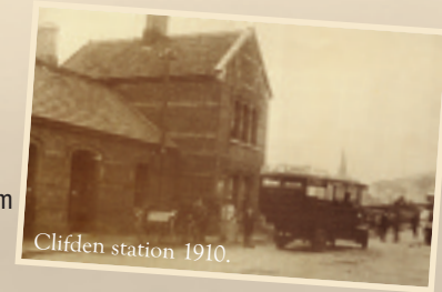
Clifden station 1910.

B&B: €40.00 per person sharing / €55.00 single occupancy