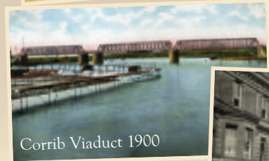
Corrib Viaduct 1900