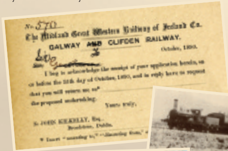
Left: Voting card on Clifden Railway proposal. Below right: Recess 1925.