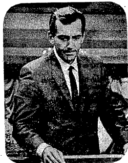
Jack Kelly stars in Deadlock tonight at 8.30.

A weekly comedy series. PRODIGY. Starring Juliet Mills, Richard Long, David Doremus, Trent Lehman and Kim Richards.