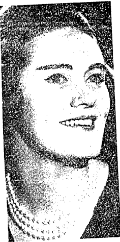
Joan Sutherland... Auber extracts.