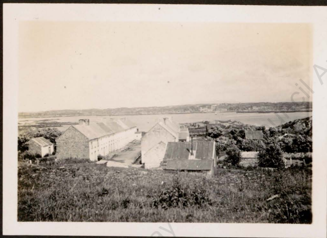
RUTLAND ISLAND (BURTON PORT IN DISTANCE)