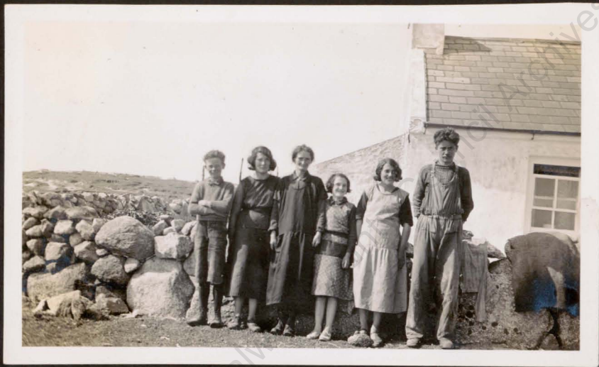
THE DIVER FAMILY