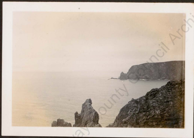
THE NORTH POINT