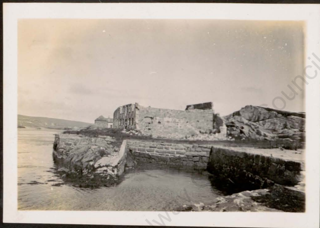
OLD FISH-CURING STATION