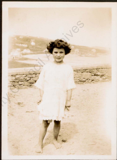
AN ISLAND CHILD (SPANISH TYPE)