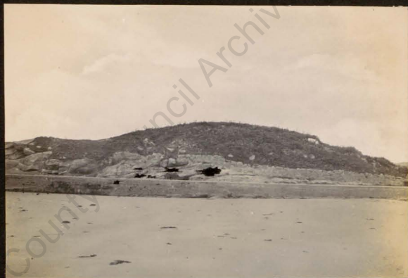
THE OLD GRAVEYARD