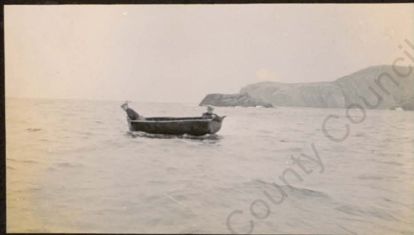
A PRIMITIVE CORACLE