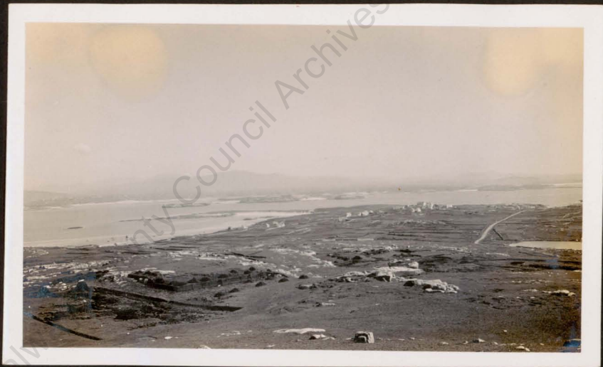
GOLA AND ISLANDS BACK TO BUNBEG