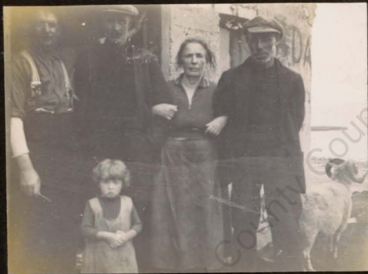
THE SLAUGHTERER AND THE ANGEL-CHILD