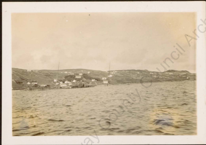
ARAN MOR. FROM BOAT