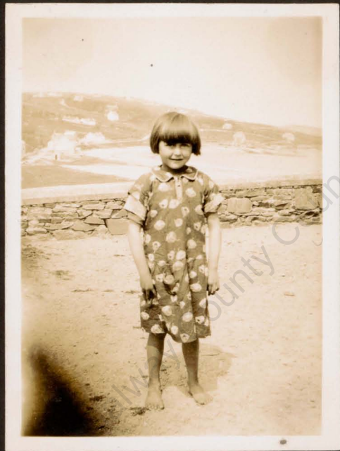
AN ISLAND TYPE