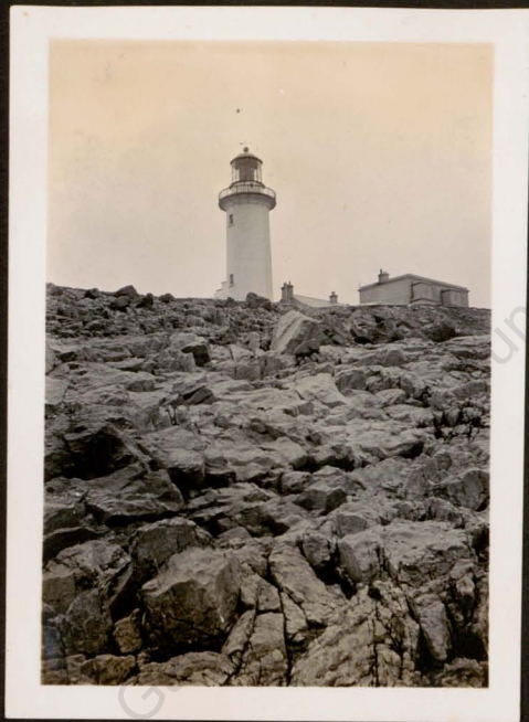
THE LIGHTHOUSE (FROM BELOW)