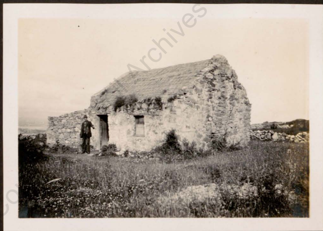
THE OLD PEDLAR