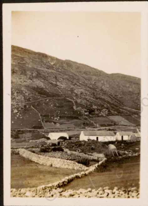
FARM STEAD MUCROSS HEAD