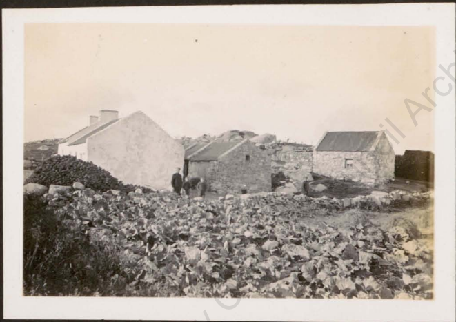
A RICH MAN'S HOME