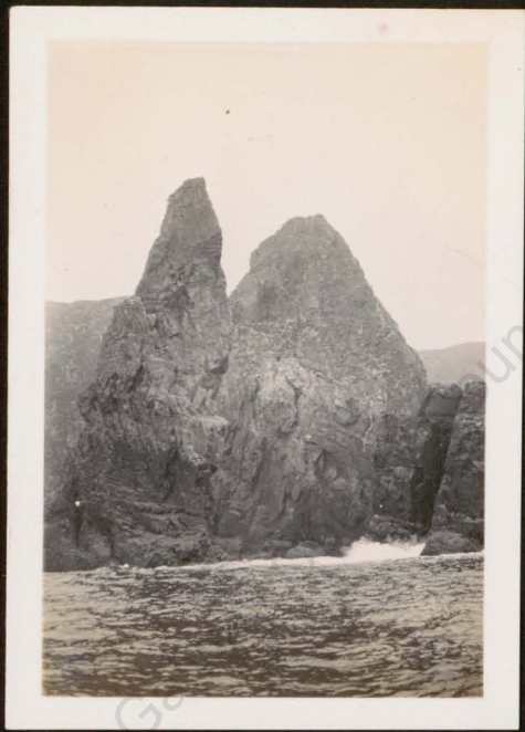
THE TWO PINNACLES