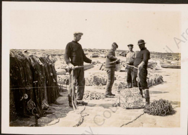
GETTING READY FOR SEA