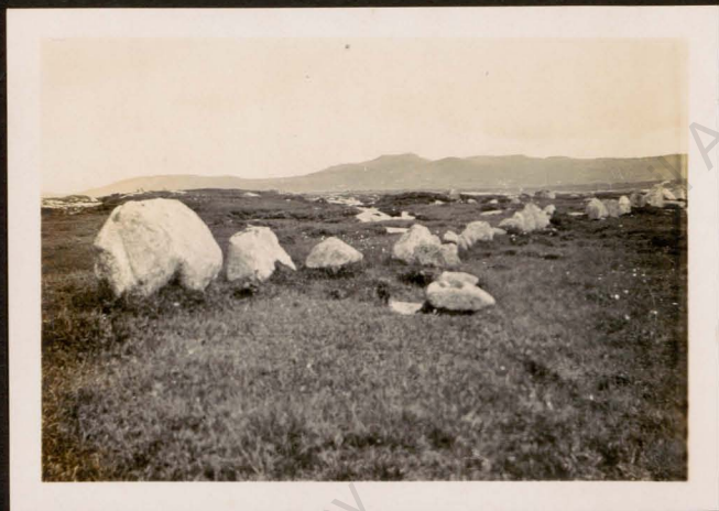
GLACIAL BOULDERS (INISHFREE)