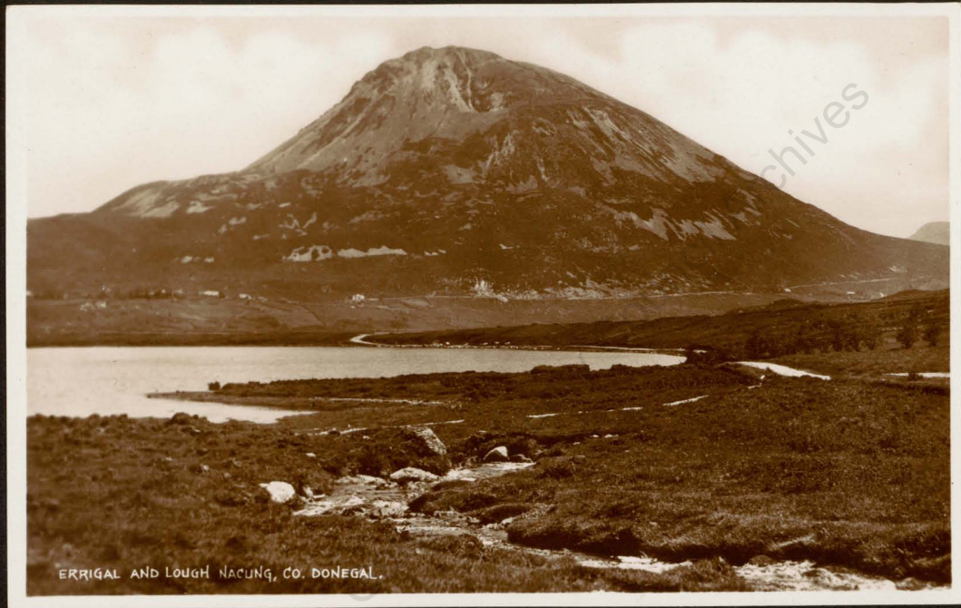
ERRIGAL AND LOUGH NACUNG, CO. DONEGAL.