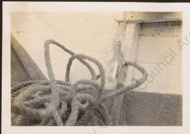
THE BOTTLE OF HOLY WATER