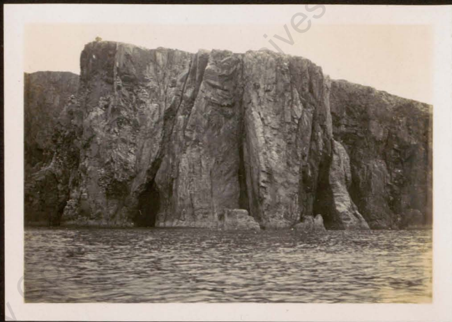
THE HIGH CLIFFS