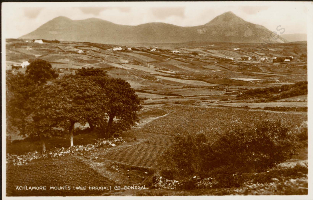
ACHLAMORE MOUNTS (WEE ERRIGAL) CO. DONEGAL.