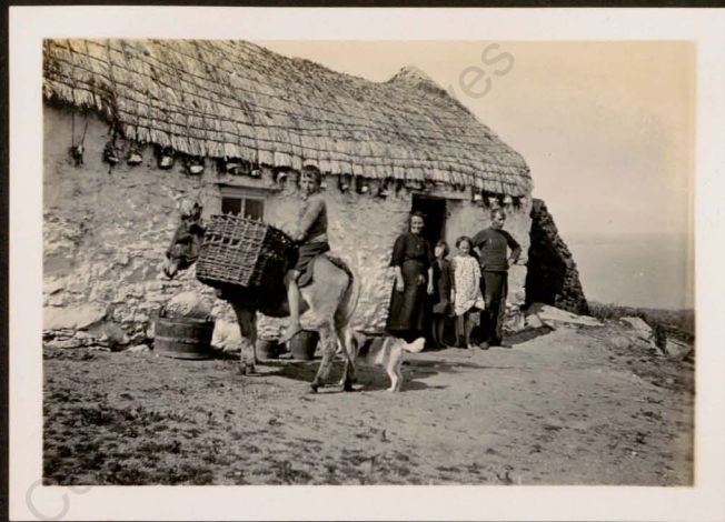
A POOR MAN'S HOME