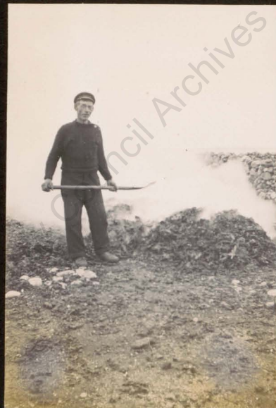
BURNING SEA WEED FOR KELP