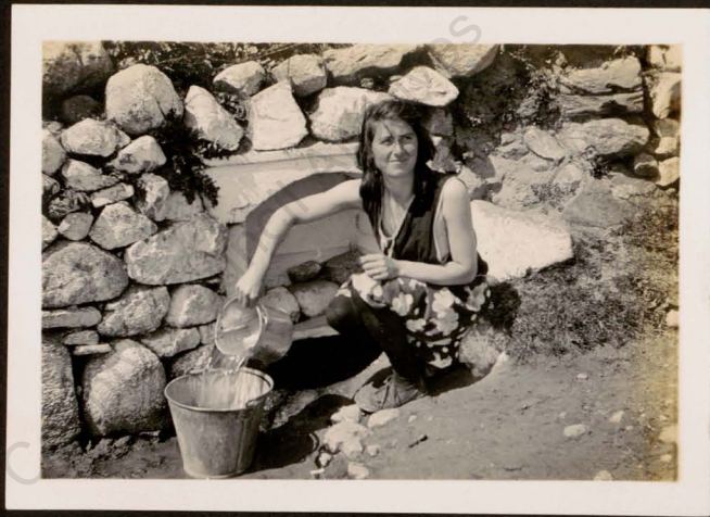
A WAYSIDE WELL