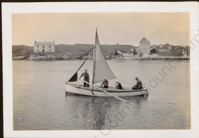
THE MAIL (PASSING RUTLAND ISLE)