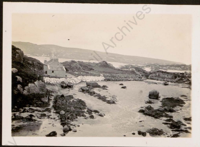
EIGHTER ISLAND (ARAN MOR BEYOND)