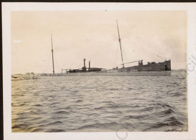
THE SEVEN-YEAR WRECK (THE BAY. ARAN MOR)