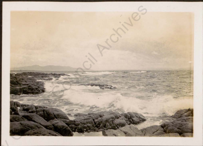
THE SOUTH COAST