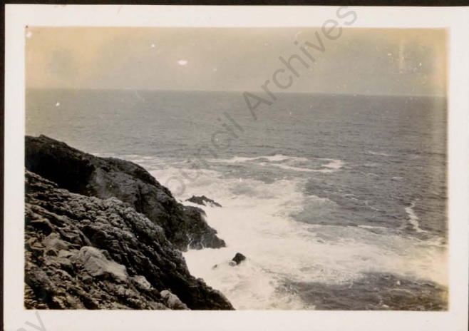
THE ATLANTIC COAST.