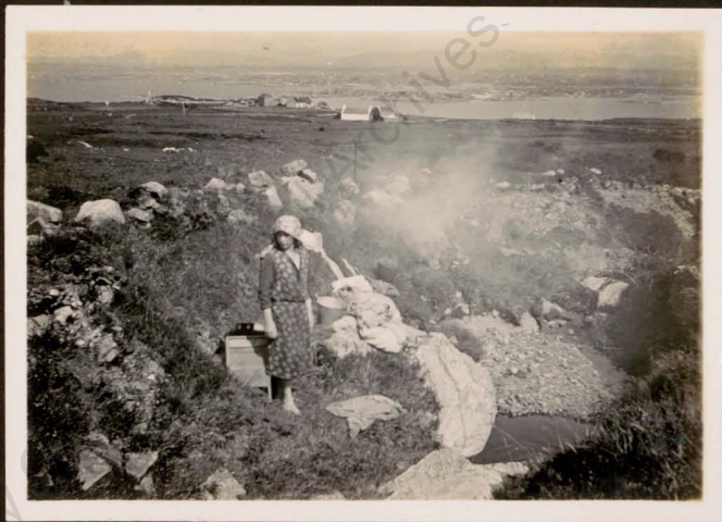
BRIDGIT BOYLE WASHING