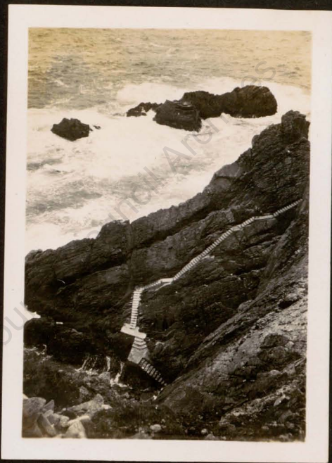
THE LIGHTHOUSE STEPS ( FROM CLIFF )