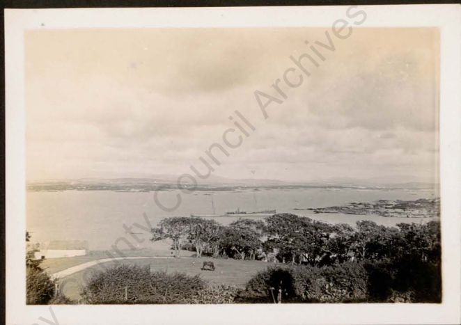
VIEW FROM MY WINDOW