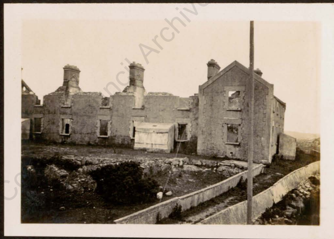
THE BARRACKS BURTONPORT (AN ENGLISH MEMORY)