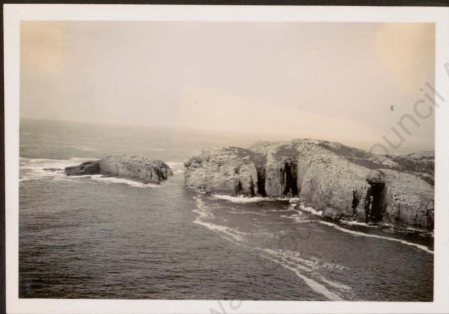
THE CLIFFS OF GOLA