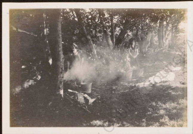
WASHING DAY (THE GLEN)