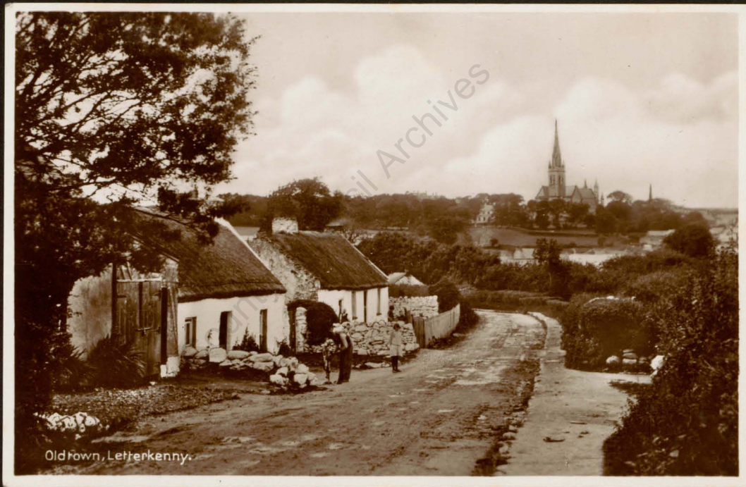
Old town, Letterkenny.