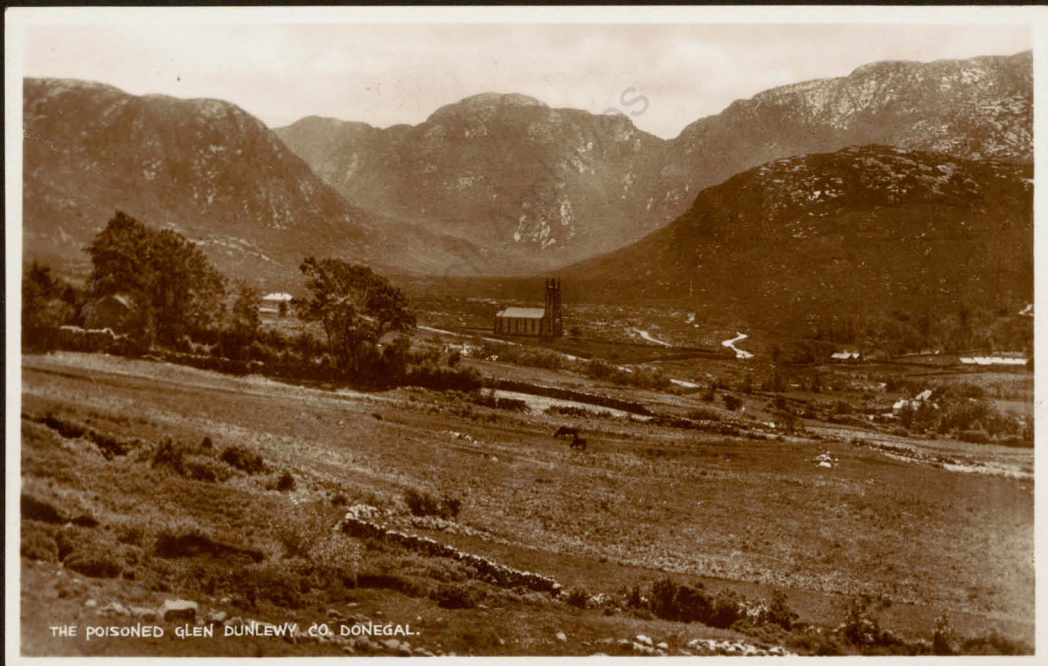
THE POISONED GLEN DUNLEWY CO. DONEGAL.