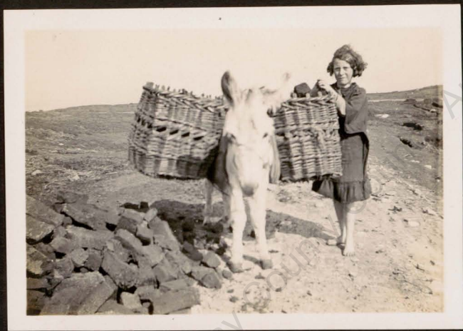
YOUTH (LOADING PEAT)