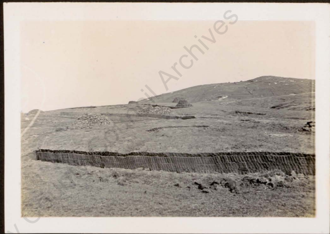
THE BOG (SHOWING PEAT WORKINGS)