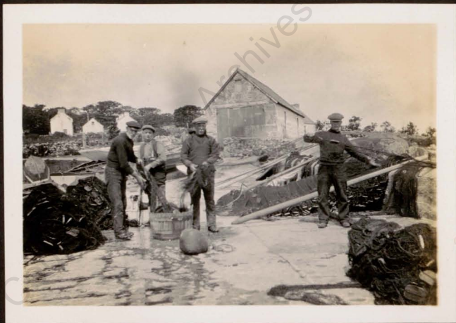
WASHING SALMON NETS