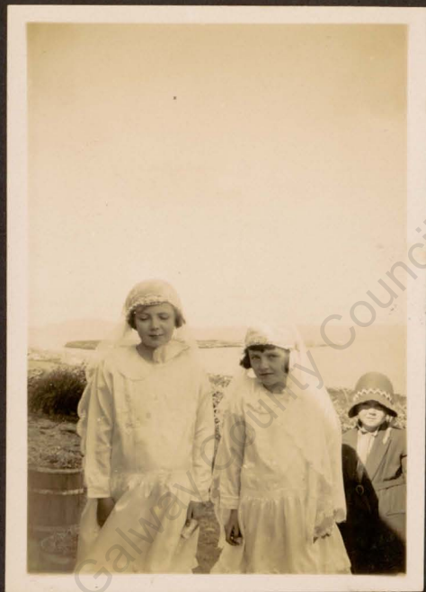
CONFIRMATION (THE SCHOOLMASTER'S CHILDREN)