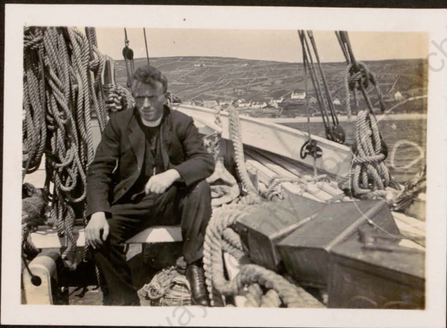
THE ISLAND PRIEST