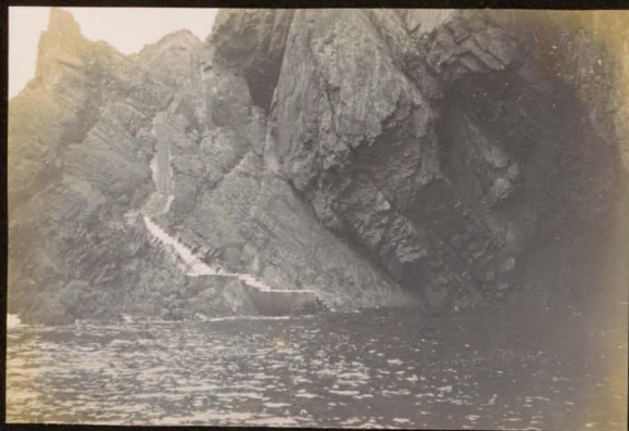
LIGHTHOUSE STEPS (FROM SEA)