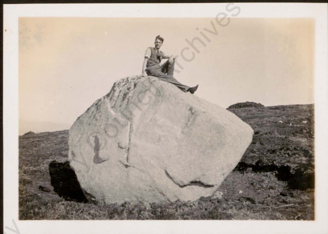
A GLACIAL BOULDER (ARAN MOR)