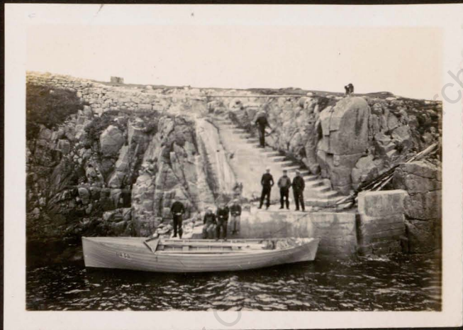
OUR MOTOR BOAT OWEY ISLAND