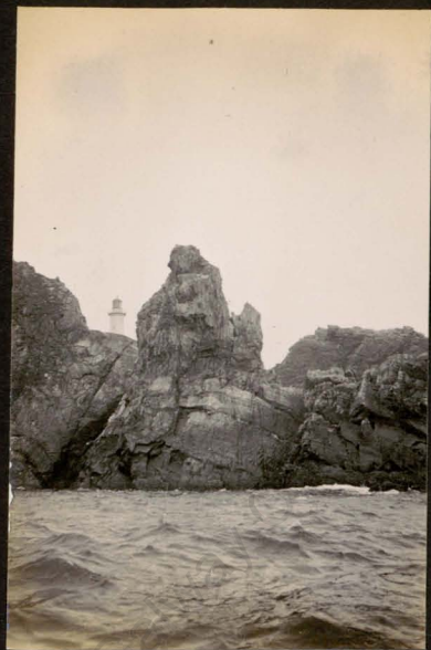
THE LIGHTHOUSE (FROM SEA)