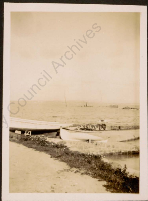
SLIPWAY & WRECK