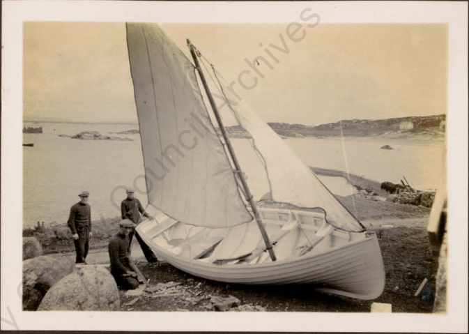
THE NEW BOAT