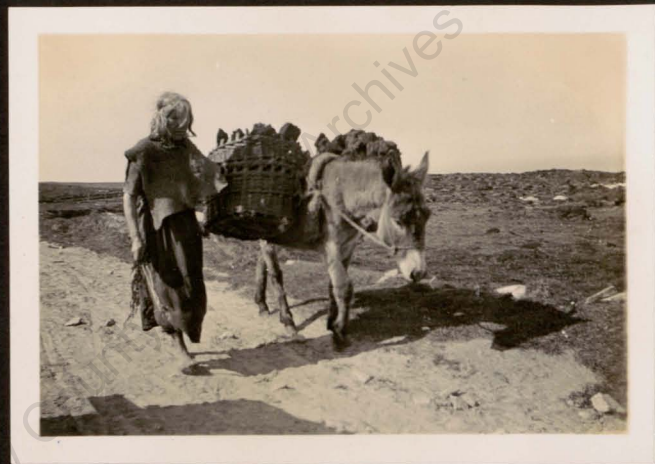
AGE (A LOAD OF PEAT)