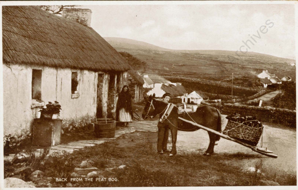
BACK FROM THE PEAT BOG.