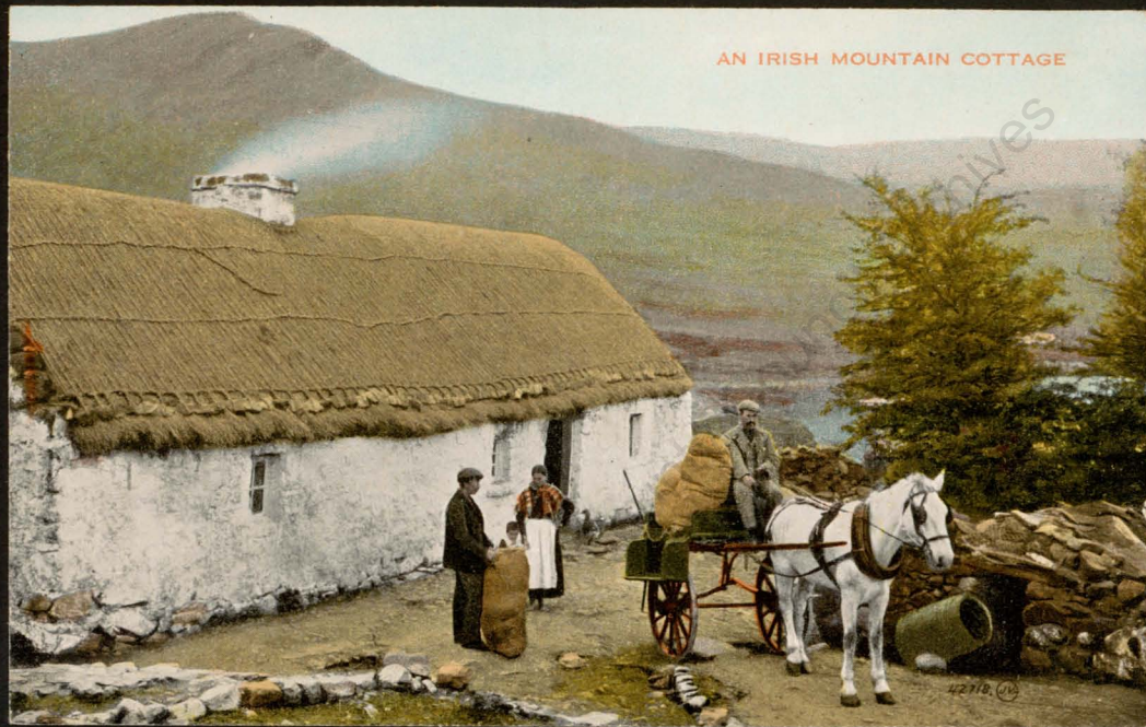
AN IRISH MOUNTAIN COTTAGE